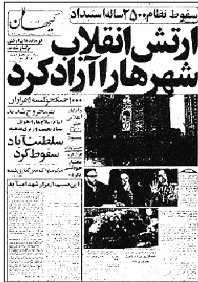
"2,500-year-old despotic monarchy collapses. Cities liberated by the revolutionary army." Kayhan newspaper, February 11, 1979

If there is such an attack, the Iranian people will unite to oppose it. Iran has many cards to play. Its armed forces are stronger than Iraq's were before the U.S. invasion. It has middle-range missiles. It has important influence with its ally, Syria, and armed sympathizers in Iraq, Lebanon and Palestine. Partisans of Iran are capable of waging irregular warfare ("terrorism" in Washington's jargon) against U.S. interests throughout the world. The recent escalation of tensions between Washington and Moscow has redrawn the map of international relations and thrown a monkey wrench into any plans to attack Iran. As of this writing cooler heads are prevailing in the U.S. administration, but this could rapidly change in the current